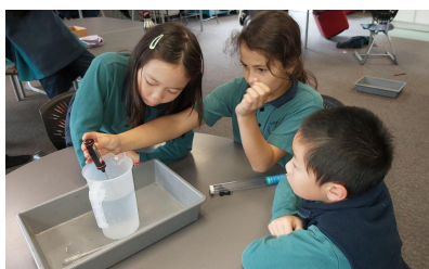
Year 4 students using a digital thermometer to record temperature of water