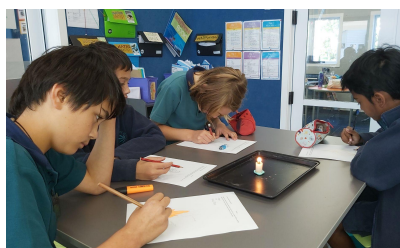
Year 6 students drawing and labelling their observations of a flame