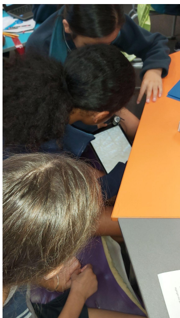
Intermediate students investigating what their skin looks like, magnified