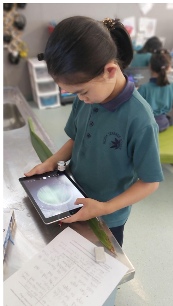
Year 5 students observing harakeke using microscope converters