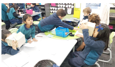
Year 3 students using peepboxes to find out which colours are seen more easily seen with less light