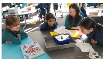
Year 4 students using fair testing by melting 3 types of chocolate