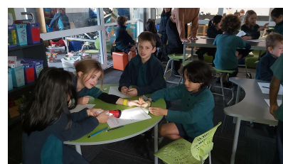
Year 3 students investigating the spread of light with differing angles