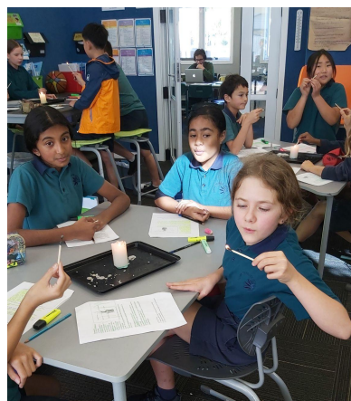
Year 6 students investigating facets of fire (right)