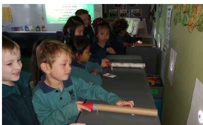
Year 3 students learning that light travels in a straight line