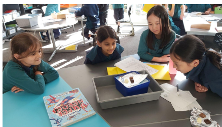
Year 4 students fair testing – which chocolate melts fastest – dairy, dark or white?