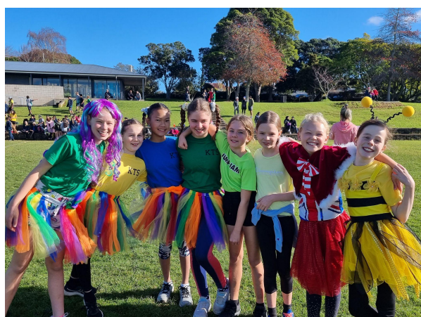
Another photo from last week's fun run.